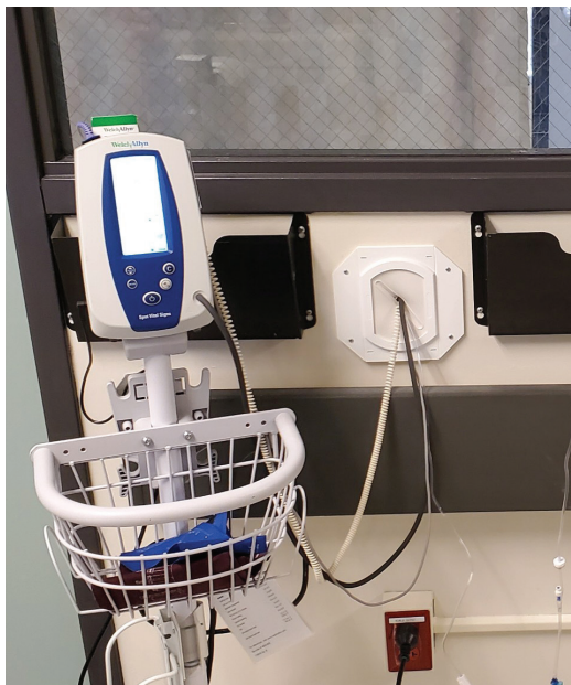
Figure 2 - EZ-Path Series 44NEZ in Non-Fire-Rated Wall

where frequently modified temporary electrical lines and extension cords must traverse fire or smoke rated assemblies, making EZ-Path a great choice. Figure 1 shows the EZ-Path Series 33 Fire-Rated Pathway used in a fire-rated application. Figure 2 shows the EZ-Path 44NEZ Smoke & Acoustical Pathway used in a non-fire-rated smoke partition.