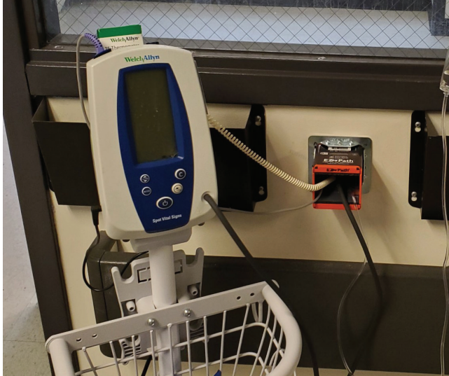
Figure 1 - EZ-Path Series 33 in Fire-Rated Wall

where frequently modified temporary electrical lines and extension cords must traverse fire or smoke rated assemblies, making EZ-Path a great choice. Figure 1 shows the EZ-Path Series 33 Fire-Rated Pathway used in a fire-rated application. Figure 2 shows the EZ-Path 44NEZ Smoke & Acoustical Pathway used in a non-fire-rated smoke partition.