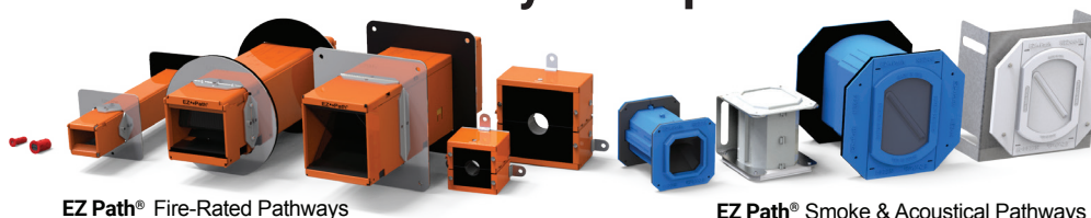
EZ Path® Fire-Rated Pathways